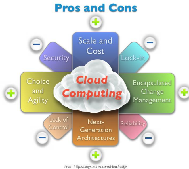
Figure 4.1 Graphical representations of Pros and Cons of Cloud Computing