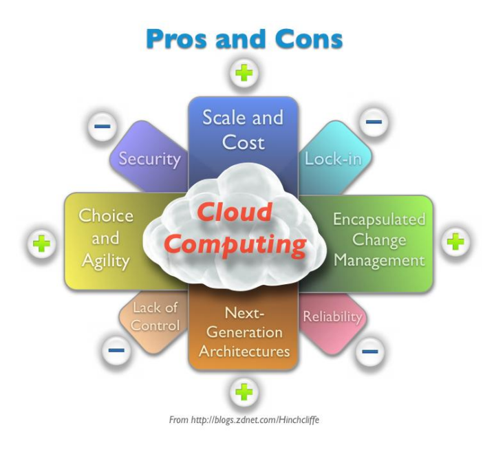
Figure 4.1 Graphical representations of Pros and Cons of Cloud Computing